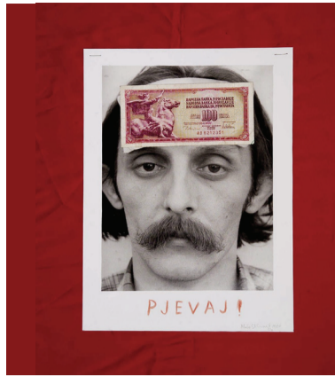
Mladen Stilinović: Sing!, 1980