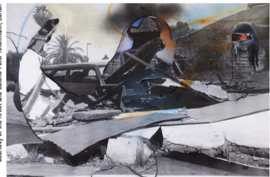
Rita Ackermann: BOECRASH!, 2009

The monumental exhibition of the Hungarian-born architect and thinker Yona Friedman, one of the most influential and internationally renowned representatives of visionary architecture, is centred on such key notions as mobile architecture, community planning, recycling and networks. Urban visions and do-it-yourself architecture in the museum.