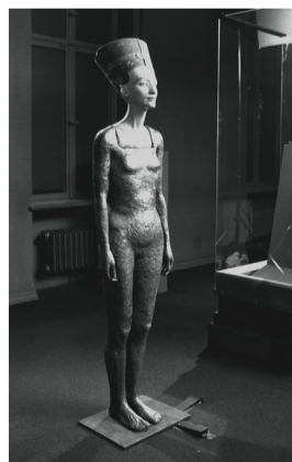
Little Warsaw: The Body of Nefertiti, 2003, Courtesy of the artist

In this exhibition, the exceptionally diverse artistic and media-theoretical activity of László Moholy-Nagy, key figure of modernist art, is arranged around the motif of light. The selection includes 200 paintings, black and white and colour photographs and graphic drafts from the period after 1922, concurrent with his development of the genre of photogram and his influential pedagogical and art theoretical activity at the Bauhaus.