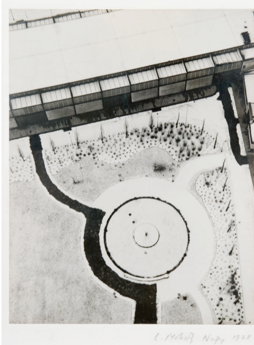
László Moholy-Nagy: View from the Radio Tower, Berlin, 1928

Mladen Stilinović (1947, Zagreb) starting his career in the early seventies, is one of the most significant representatives of Central European neo-avant-garde art. The retrospective show in Ludwig Museum is his first exhibition of such large scale in Hungary as well as in the region, presenting his most important installations, collages, photographs, artist's books, and groups of artworks. Throughout his diversified work, Stilinović explores ideological signs and their social aspects. His works criticise the language of politics, the institutional hierarchy within art, and the role of money and labour in society using the devices of irony, paradox and manipulation.