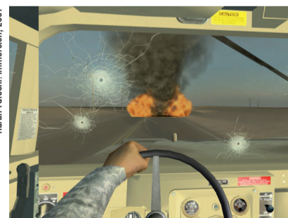
Harun Farocki: Immersion, 2009

Almost 20 years have passed since Rita Ackermann left Budapest for New York, where she soon became a well-known figure of the 90s underground art scene, which preferred mixing all genres of visual culture with inspirations drawn from fashion, music or street culture. The exhibition comprises her latest works from the last three years, juxtaposing them with key pieces from her entire oeuvre as points of reference along which the path of her artistic career can be observed.