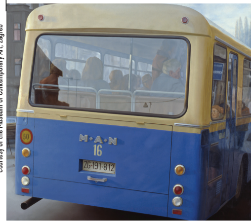
Jadranka Fatur: Bus for Cirok, 1975

The spectacular new museum buildings, the growing number of visitors all over the world, clearly show the fundamental changes that museums went through during the last couple of decades. The new museums are not only places for keeping and preserving priceless works of art, museums also educate and entertain masses of people. On the occasion of the 20th anniversary of its first permanent exhibition, Ludwig Museum Budapest reflects on the topic of the museum, that is on itself, through the critical works of Hungarian and international neo-avant-garde artists, as well as through the ironic, witty works of contemporary artists, many of which can be seen for the first time in Hungary.